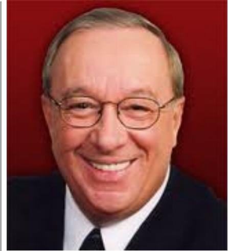
The Hon. Jacques Demers

Guest speaker at the celebration will be Former WHL, AHL and NHL coach, Jacques Demers who has publicly admitted that he is functionally illiterate. He has since become a major advocate for literacy initiatives.