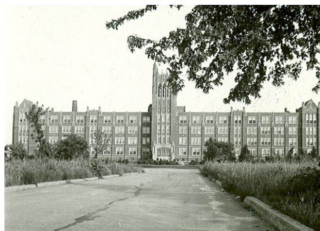
Academy Drive in Sandwich South Township (South Windsor). The first St. Mary's Academy was built on the south east corner of Park St. and Ouellette Ave. It was torn down in 1929 to make way for the new tunnel crossing. The structure in the photograph was built between 1927 and 1929. The school was closed in 1971 and torn down in 1977.