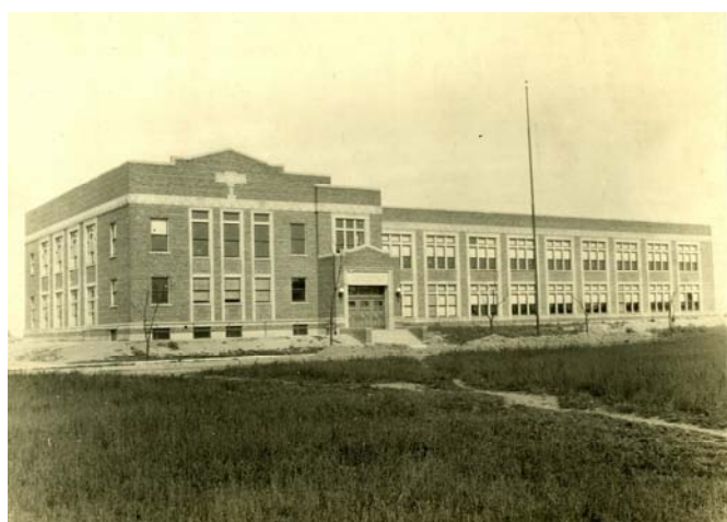
GORDON MCGREGOR PUBLIC SCHOOL (above, left): Built in 1924. Named after one of the original investors of the Ford Motor Company of Canada. Located in Ford City. Photograph taken in 1924.