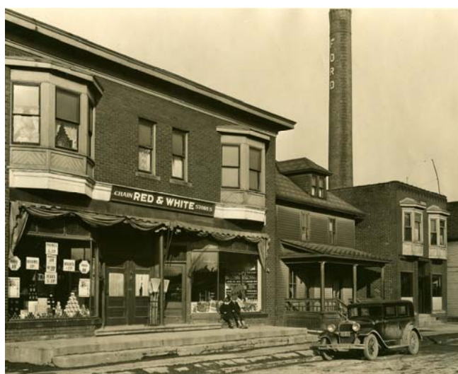
Red and White Chain Store. Located on Drouillard Road in Ford City. Photograph was taken circa 1930 by Seneca Studios of Riverside.

To find out more information about material found in the archives, please contact the archives directly at 519-255-6770, Ext. 4414.