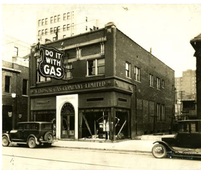
Windsor Gas Company Limited. Located on Pitt St. Photograph was taken circa 1925.

Included are documents from Windsor's amalgamated communities of Ojibway, Sandwich, Walkerville, Ford City/East Windsor, Riverside and the Townships of Sandwich, Sandwich East and Sandwich West. Each of these collections consists of material from the various municipal governments such as: council minutes, tax assessment rolls, deeds, agreements, agendas, committee minutes and reports.