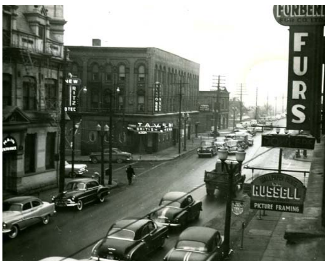
DOWNTOWN WINDSOR: Sandwich Street and Ouellette Ave. showing the Ritz and British American Hotels. Photograph taken in late 1940s early 1950s.